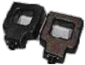
Traction current sensors