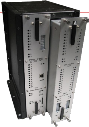
Dual Module TECU-Lite System

“The TMV system is like converting your locomotive into an all wheel drive SUV.”