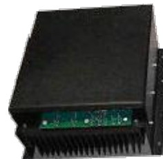
Battery Field Chopper

“The TMV System has eliminated all wheel slip problems and allows us to reach the loading dock on the first try every time at a much safer speed.”